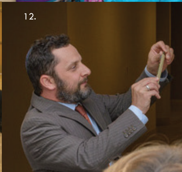
Photos from Harold Schnitzer Health and Rehabilitation Care Center open house.