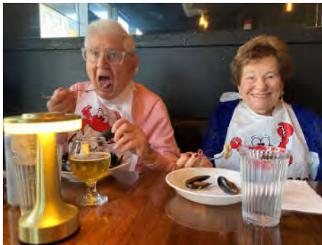
Left and below: Lunch outing to Blue Sea.