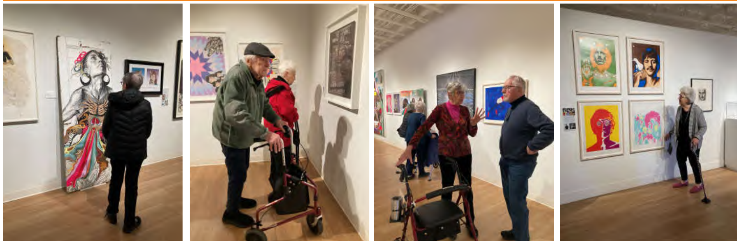
Residents of the Rose Schnitzer Manor visiting the Schnitzer Collection on NW Yeon Ave, Portland.